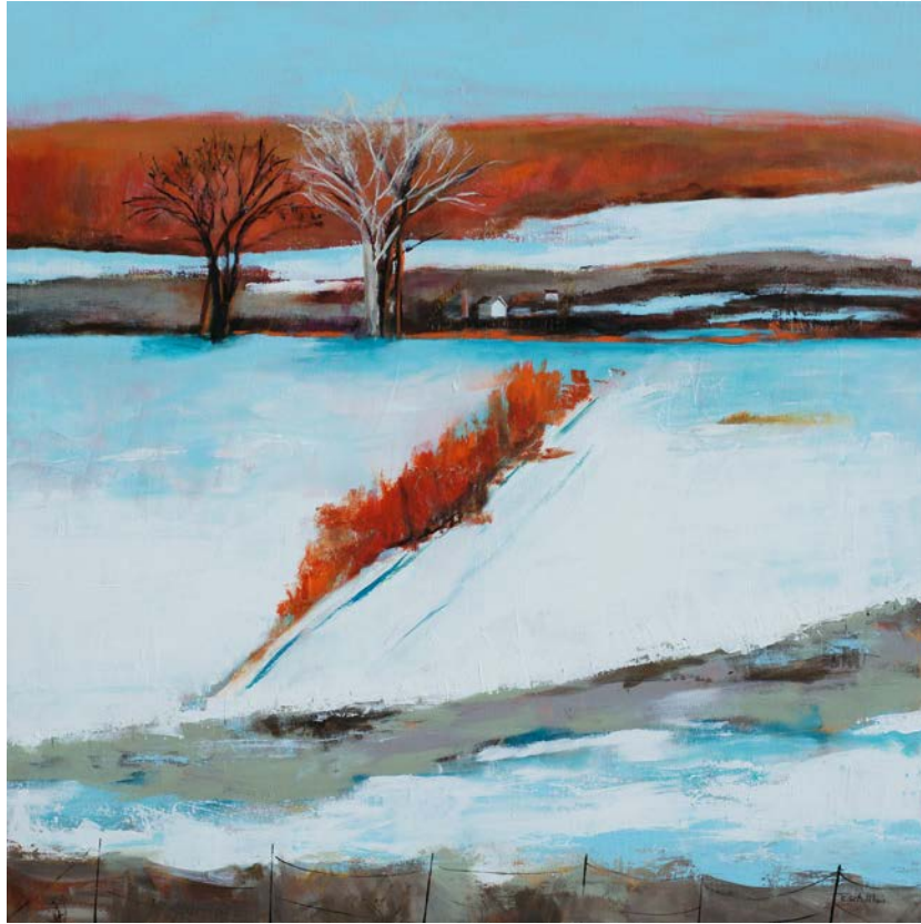
FIRST SNOW – CANDY SCHULTHEIS

CARROLLWOOD CULTURAL CENTER DECEMBER 2019