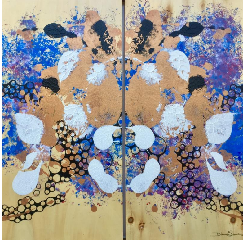
Bee by Dionne SeEVERS