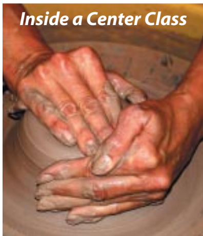
Inside a Center Class